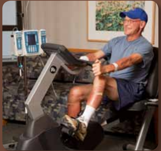
An exercise bike was purchased for patients recovering in the Bone Marrow Transplant and Hematology Unit.