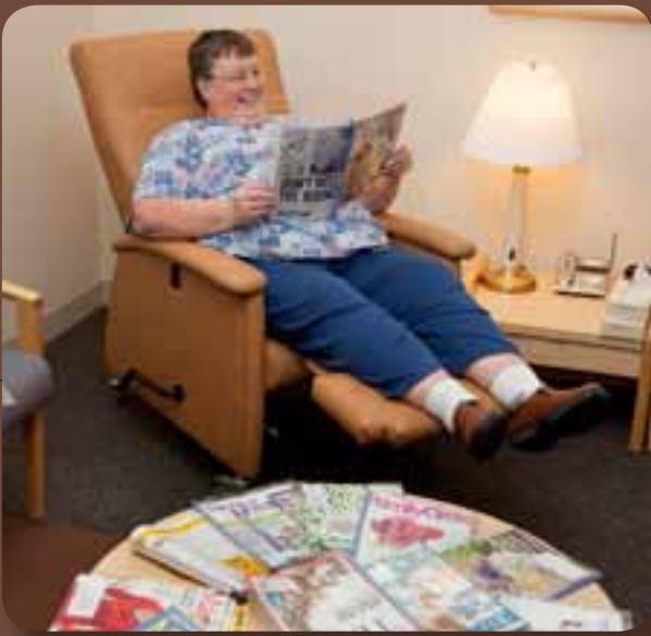
A special recliner was purchased for the Mohs Surgery Clinic to help aid recovery and healing for patients after surgical procedures.

For Friends' 2008-2009 financial information, please visit friendsofuwhc.org .