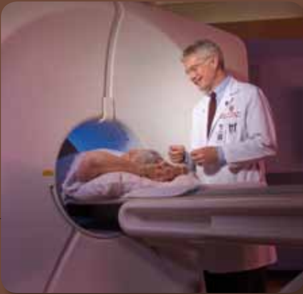
A grant to Radiation Oncology was used to fund the Serenity in Scanning program. This program enhances the PET Scan experience and reduces the stress felt by cancer patients.